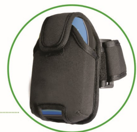
Hands free design